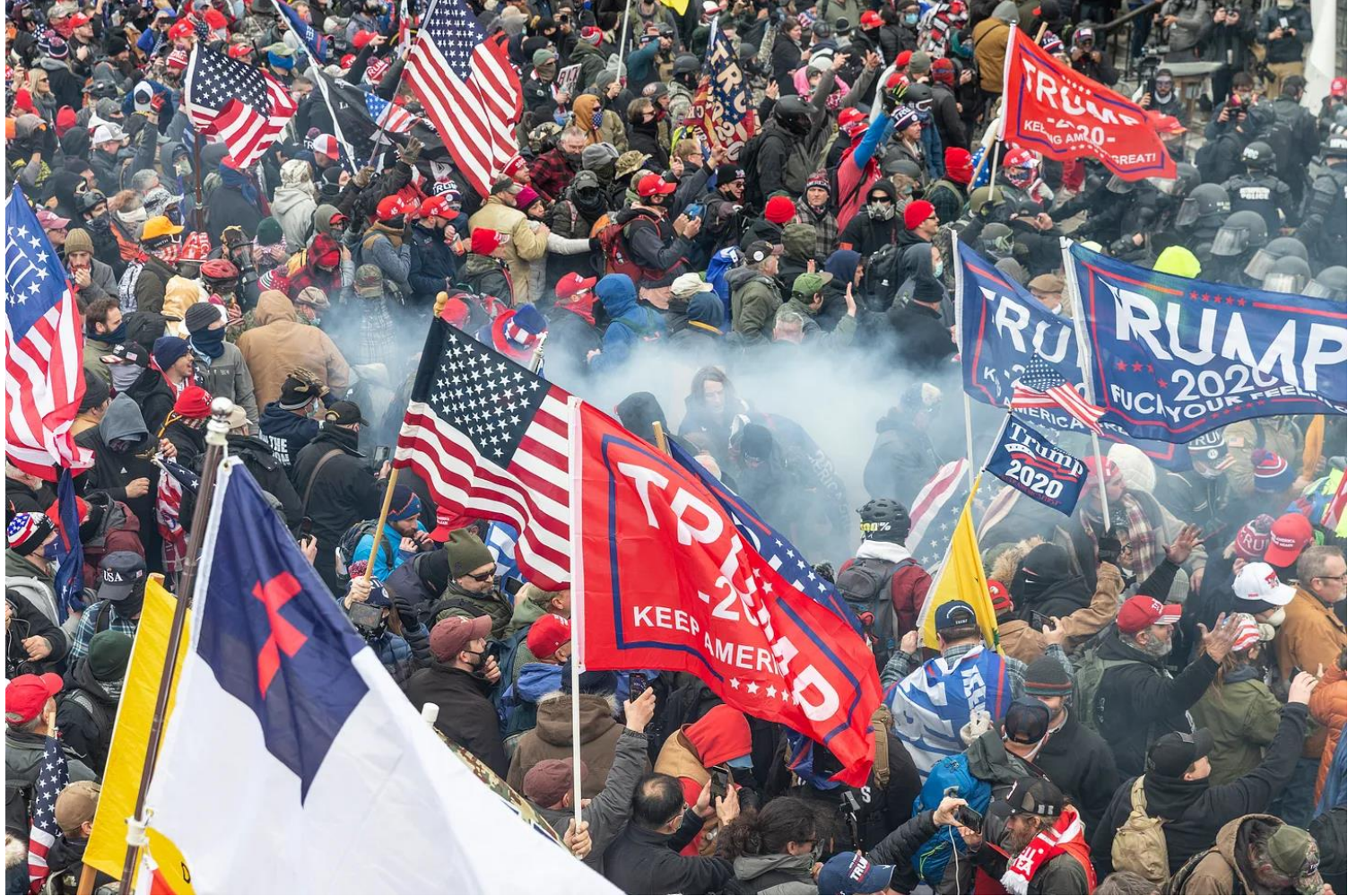
Insurrectionists outside the Capitol building on Jan. 6.