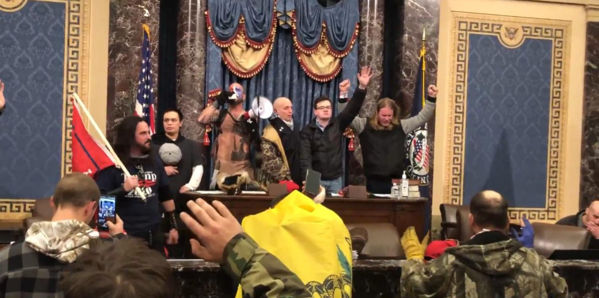
Screengrab of Jacob Chansley praying in the Senate Chamber on Jan. 6, 2021, as others lift up their hands.